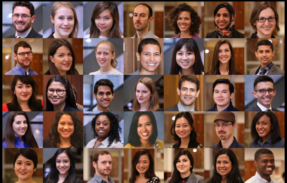
THE ROBERT A. KATZMANN DISTINGUISHED FELLOWSHIP AWARD Immigrant Justice Corps Inaugural Class of 2014